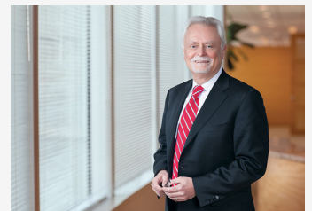
Global Chief Investment Officer

There's no truth to the claim that Republicans are conservative on fiscal policy and Democrats are big spenders. They both spend like it's going out of fashion. There is a difference, of course, in sources of taxation and where the money might be spent, but the total amount of money going into the economy in aggregate, is not, in my view, going to be materially different under one party or the other.